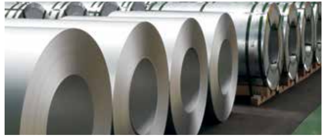
Galvanised steel sheets