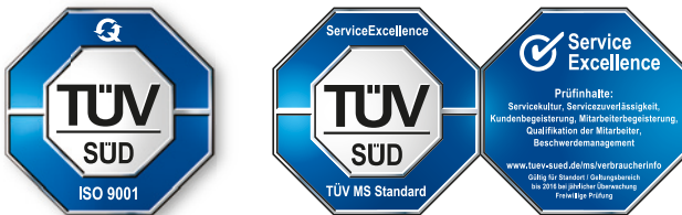
Example of a single certification mark and a double octagon