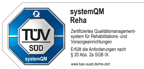
Example of a certification mark for new standards