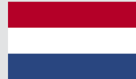
The Netherlands (3)