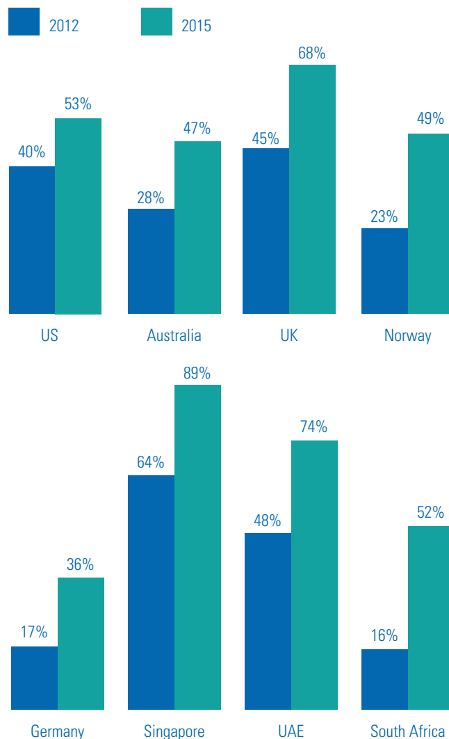
PERCENTAGE OF FIRMS WITH MORE THAN 60% OF WORK GREEN IN SELECTED COUNTRIES (2012 AND EXPECTED FOR 2015)

Façades also need to be over-engineered to withstand powerful winds. Curtain walls at the topmost floors have to endure wind speeds far greater than those at ground level. Building façades in regions prone to hurricanes, typhoons or tornados must be strong enough to resist the higher pressures of storm winds as well as wind-borne impacts of flying debris. Similarly, façades must have both the flexibility and resilience to withstand building sway, particularly in earthquake zones.